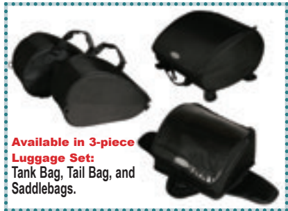
Available in 3-piece Luggage Set: Tank Bag, Tail Bag, and Saddlebags.

Fastrax® series luggage works great on scooters too!