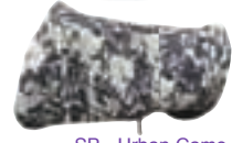
SP - Urban Camo