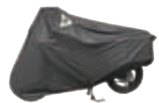
AT - Adventure Touring