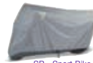
SP - Sport Bike