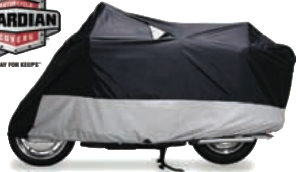
Guardian Weatherall - Touring