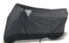
SP - Sport Bike