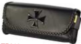
TP211 Tool Pouch