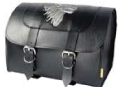
TT513 Max-Pax Tail Trunk