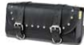
TP252 Studded Tool Pouch