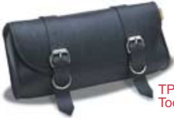
TP100 Tool Pouch