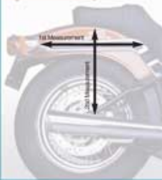
Diagram for reference only

Allow at least 1" clearance from the bottom of the bag to the top of exhaust pipe to prevent damage caused by sagging of loaded bag