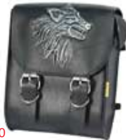
SBB460 Sissy Bar Bag