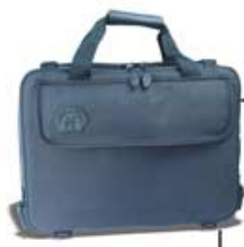
MCS500 Computer Bag