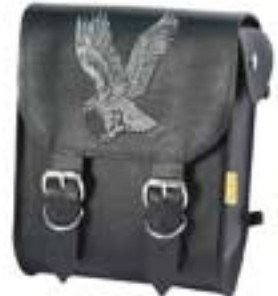
SBB420 Sissy Bar Bag