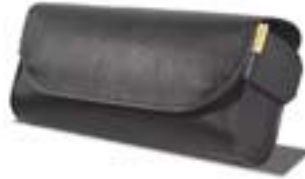
TP210 Tool Pouch