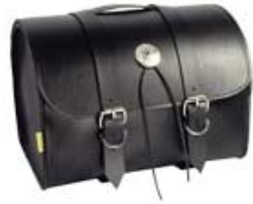
TT506 Max-Pax Tail Trunk