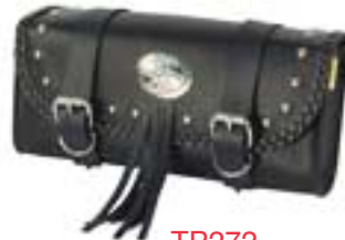
TP272 Tool Pouch