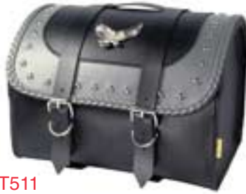
TT511 Max-Pax Tour Trunk