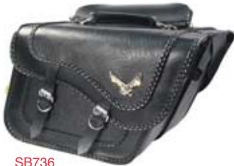
SB736 Super Slant Saddlebag