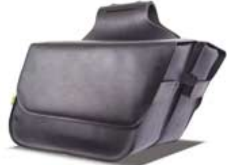
SB803 Super Slant