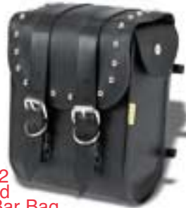
SBB452 Studded Sissy Bar Bag