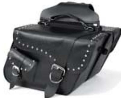
SB752 Studded Super Slant Saddlebag