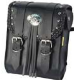
SBB431 Sissy Bar Bag