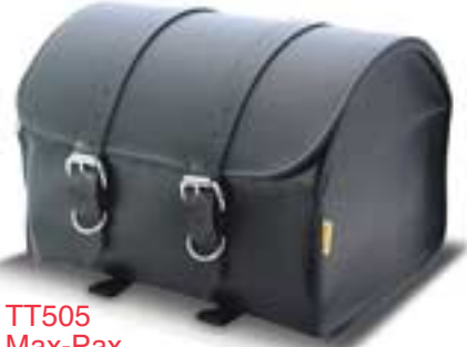
TT505 Max-Pax Tail Trunk