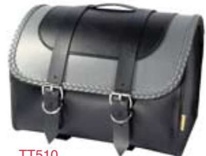
TT510 Max-Pax Tail Trunk