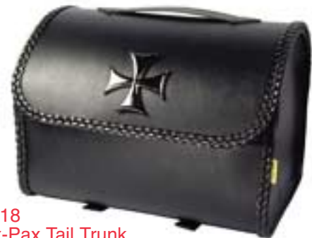
TT518 Max-Pax Tail Trunk