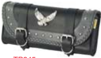
TP245 Tool Pouch