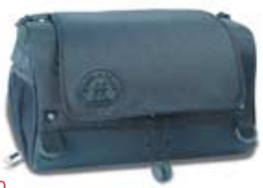
MCS200 Overnight Bag