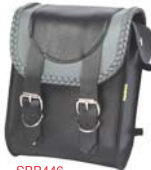
SBB446 Sissy Bar Bag