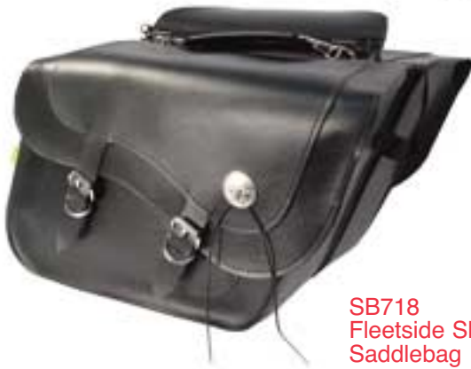
SB718 Fleetside Slant Saddlebag