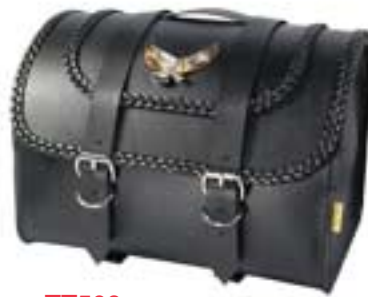
TT509 Max-Pax Tail Trunk