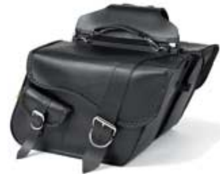
SB751 Braided Super Slant Saddlebag