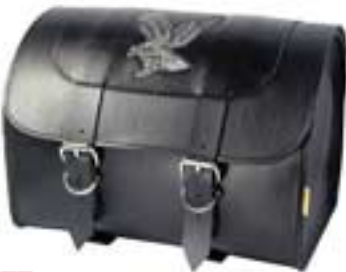
TT514 Max-Pax Tail Trunk