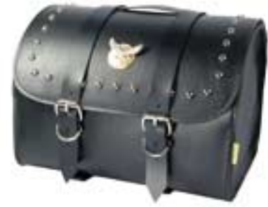
TT508 Max-Pax Tail Trunk