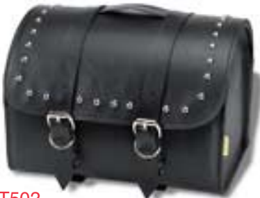
TT502 Studded Tail Trunk