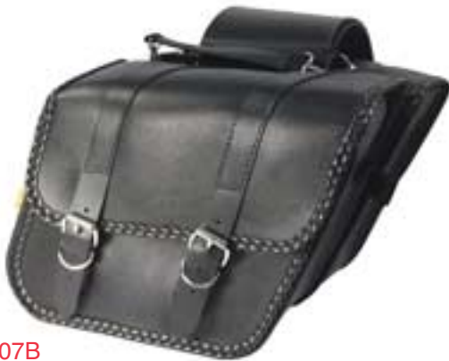
SB707B Deluxe Compact Slant Saddlebag