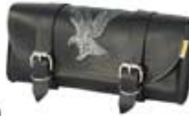
TP222 Tool Pouch