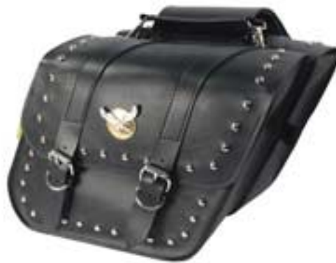
SB707S Deluxe Compact Slant Saddlebag