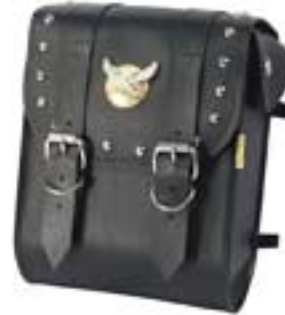
SBB441 Sissy Bar Bag