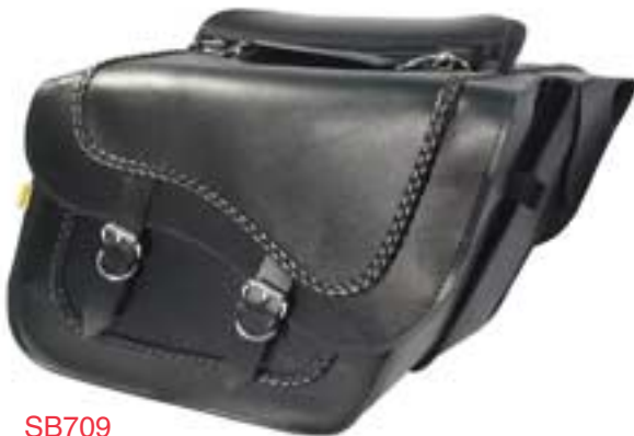
SB709 Fleetside Slant Saddlebag