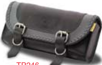
TP246 Tool Pouch