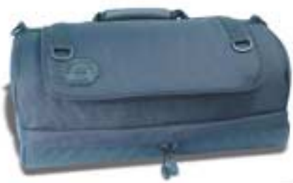
MCS300 Garment Bag