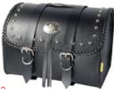
TT512 Max-Pax Tail Trunk