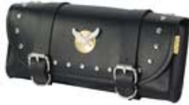
TP242 Tool Pouch