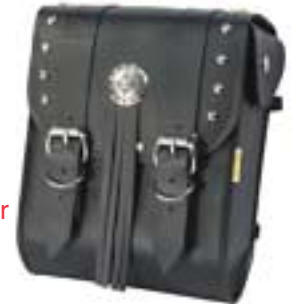
SBB480 Sissy Bar Bag