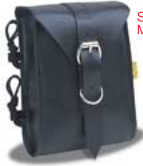
SBB421 Mini Sissy Pack