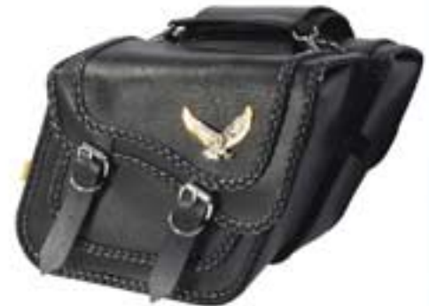
SB708 Compact Slant Saddlebag