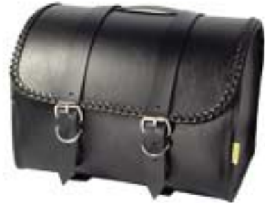
TT507 Max-Pax Tail Trunk