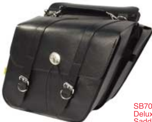
SB700 Deluxe Slant Saddlebag