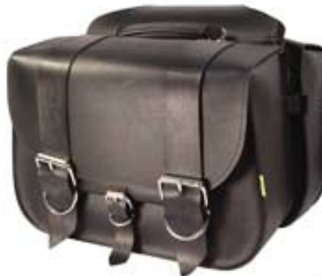
SB444 The Mechanic