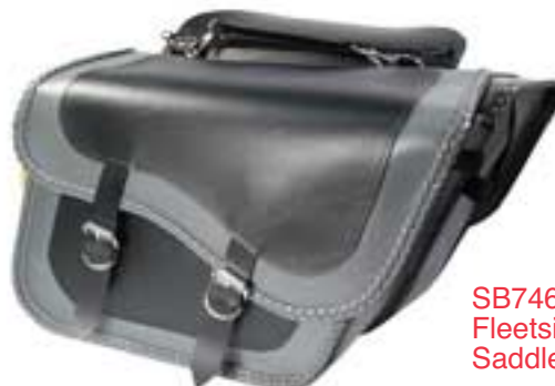
SB746 Fleetside Saddlebag