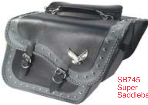
SB745 Super Saddlebag