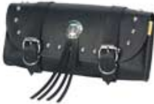
TP280 Tool Pouch