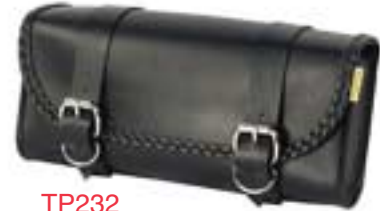
TP232 Tool Pouch