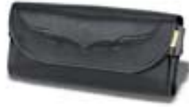
TP230 Tool Pouch