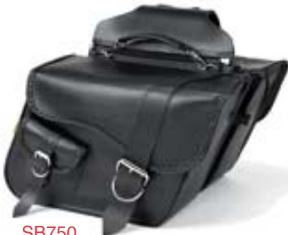
SB750 Standard Super Slant Saddlebag