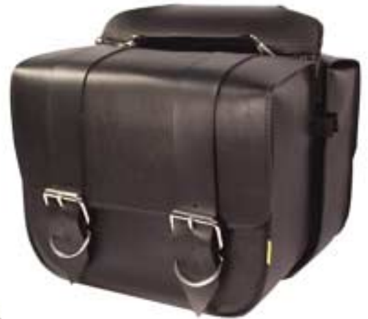
SB311 Touring Saddlebag