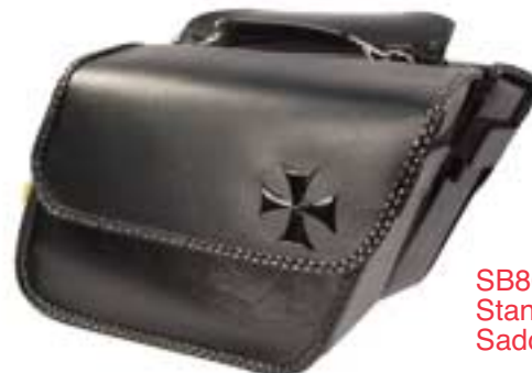
SB805 Standard Slant Saddlebag