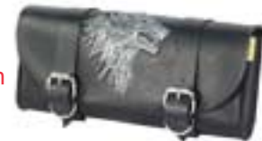
TP262 Tool Pouch