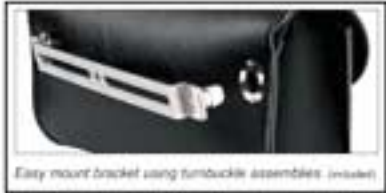
Easy mount bracket using turnbuckle assembly (shown)