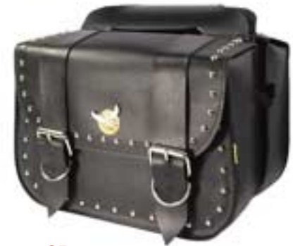
SB340 Touring Saddlebag