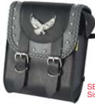
SBB445 Sissy Bar Bag