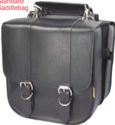
SB301 Standard Saddlebag