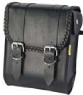
SBB481 Sissy Bar Bag