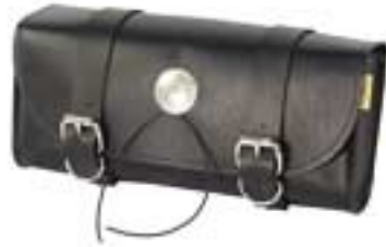
TP100D Tool Pouch