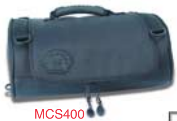
MCS400 Roll Bag