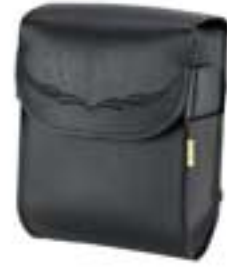
SBB430 Sissy Bar Bag