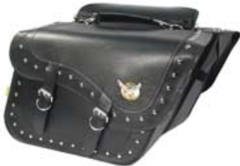
SB727 Fleetside Saddlebag