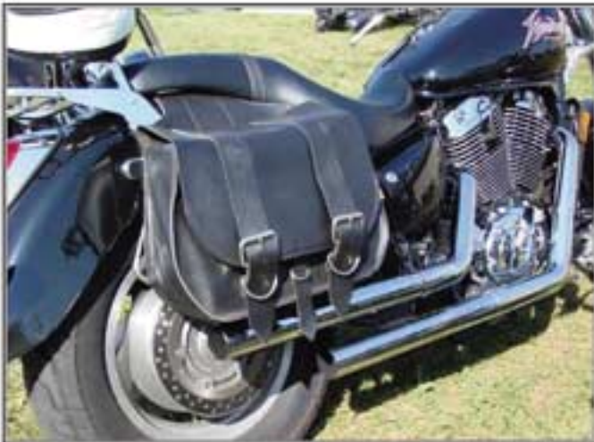
SB370 Wild Willie