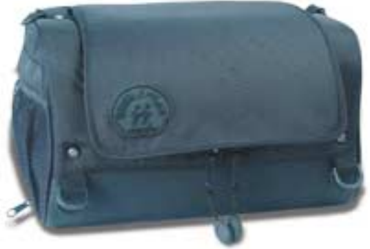
MCS100 Main Bag