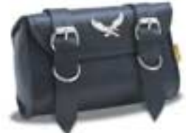
TP111 Mini Tool Pouch