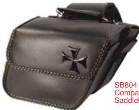
SB804 Compact Slant Saddlebag