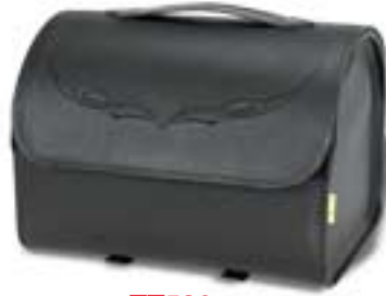
TT530 Max-Pax Tail Trunk