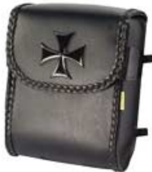
SBB473 Sissy Bar Bag