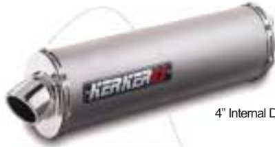
4" Internal Disc Slip-On

Sport & Street / Harley Davidson Motorcycles