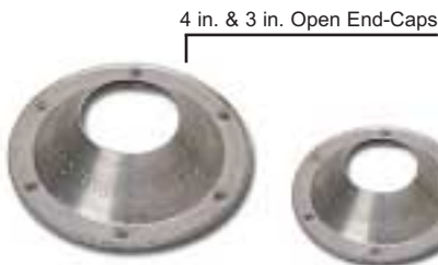
4 in. & 3 in. Open End-Caps