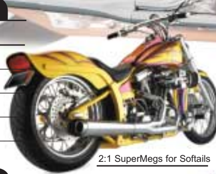
2:1 SuperMegs for Softails