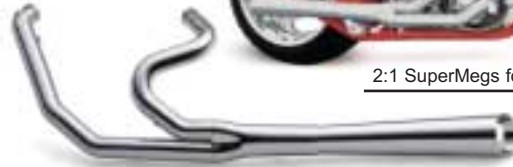
Kerker 2:1 Megs Style System