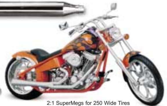
2:1 SuperMegs for 250 Wide Tires