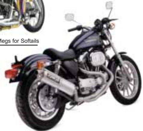
2:1 Sportster System in Brushed Aluminum