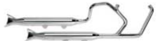
Kerker 2:2 Crossover System