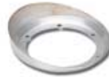
4" Heat Shield