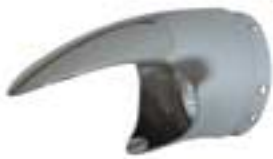
Yaffe Big Poppa, 108-8040