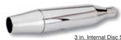
3 in. Internal Disc Slip-On