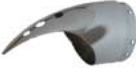
Yaffe Claw, 108-8042