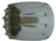
Yaffe Afterburner-Chrome, 108-8037