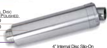
4" Internal Disc Slip-On