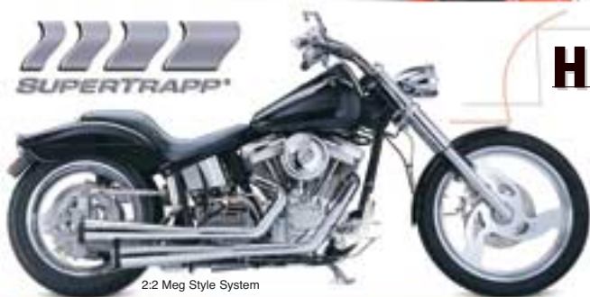
2:2 Meg Style System