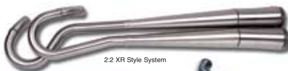
2:2 XR Style System