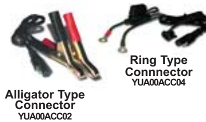
Alligator Type Connector YUA00ACC02